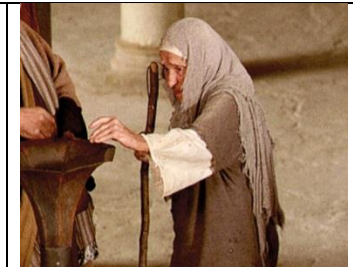
Widow who gave her last two coins (Christianity)