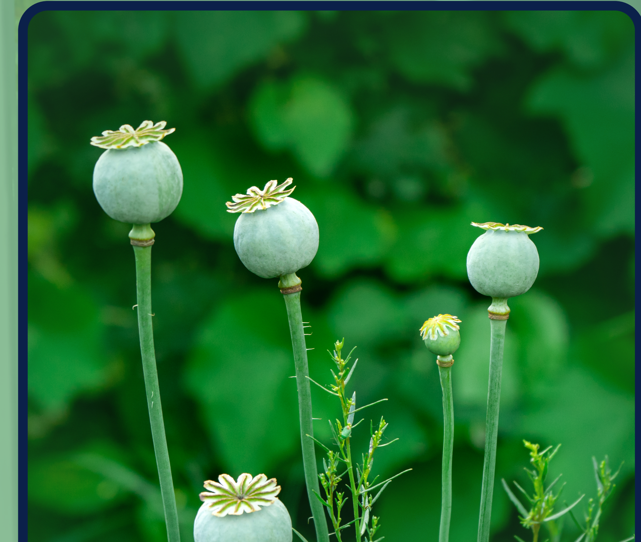
poppy seeds are dispersed from a 'pepper pot' head, when the wind blows the seeds shake out