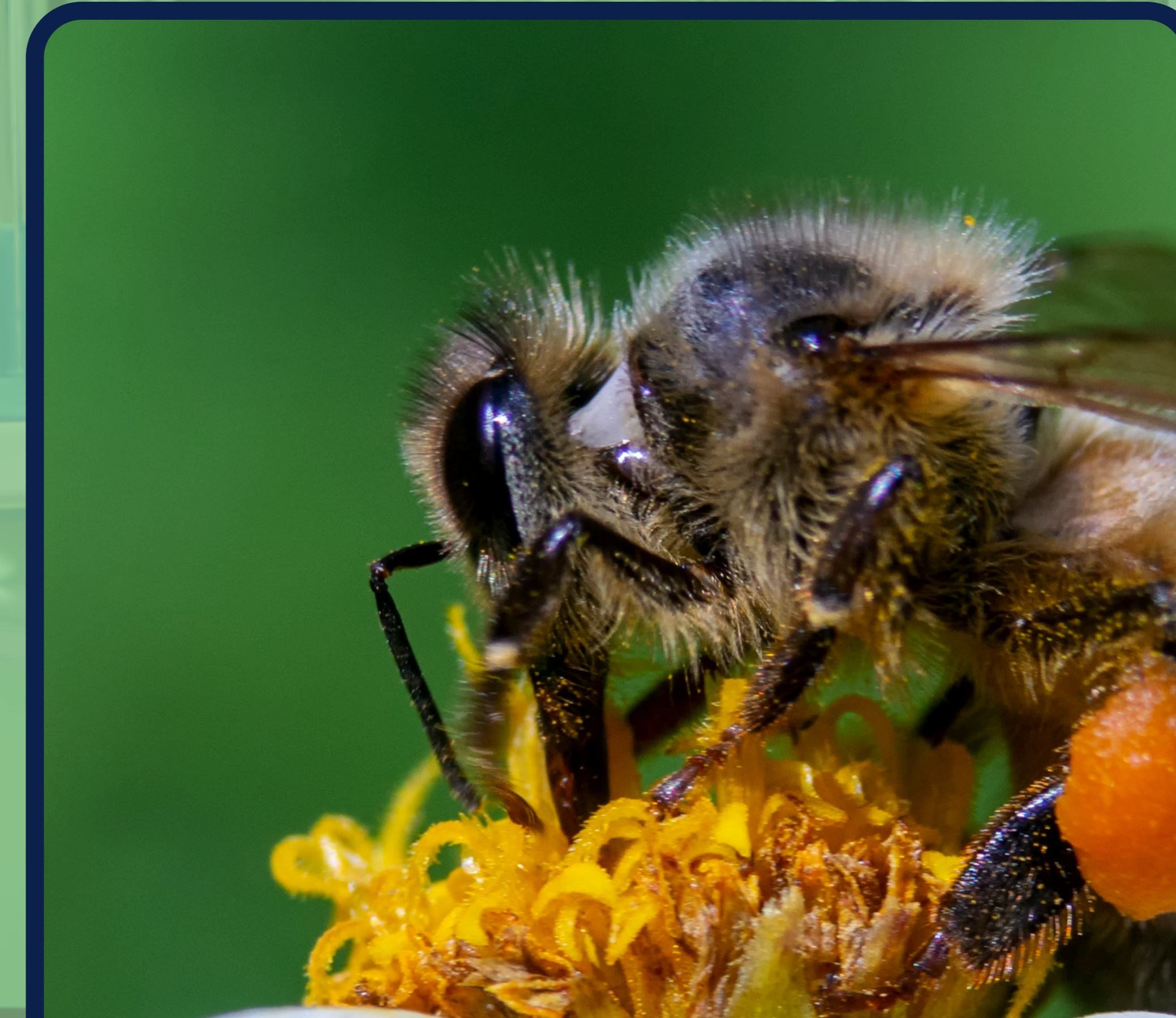
many flowers rely on animals to help with pollination by moving pollen from one flower to another

spreading things out over an area , seeds do this to help to reproduce